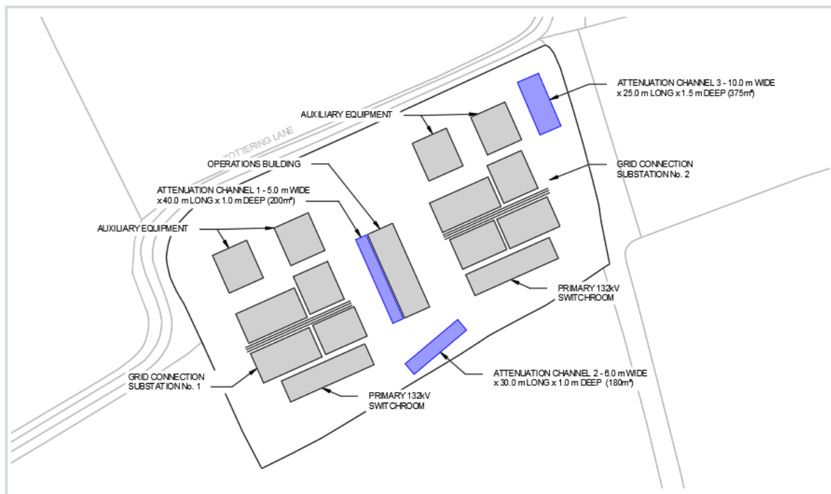
Plate 2. Location of Attenuation Storage